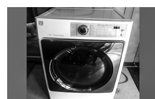
KENMORE ELITE FRONT LOAD WASHER AND DRYER with 2 pedestals for sale, 5 years old, dryer is showing error signs and needs maintenance, washer good condition, Sold As Is, cost $2,400 new, sell for $400. (931)619-8107.

LIVING ROOM SET for sale, reclining sofa, loveseat, and recliner in multi-color durable cloth, excellent condition, $175. Call, (931)205-0744.