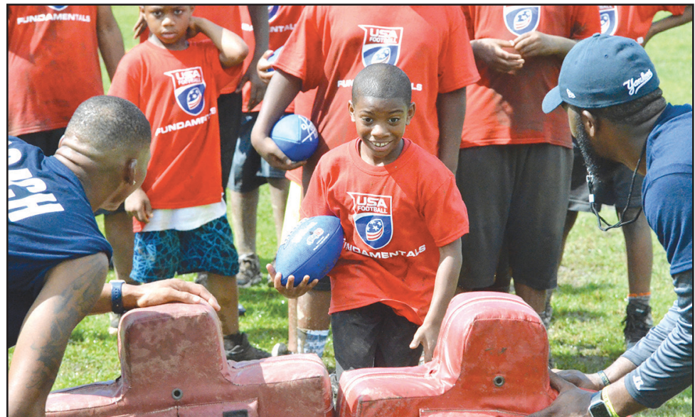
A camper prepares to run through the bags.