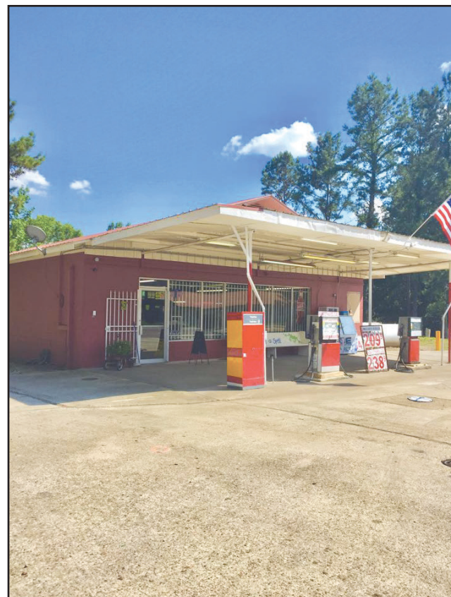
Outside of Leaf River General Store.