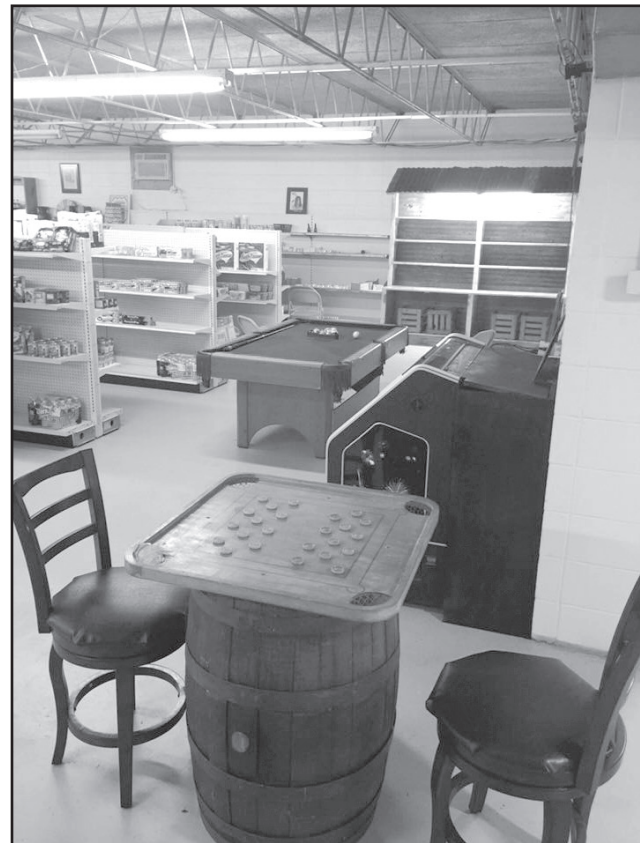
Inside the Leaf River General Store.

320 FRONT ST. DOWNTOWN LAUREL 601-428-5782 WWW.LOTTFURNITURE.CO