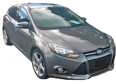
2014 Ford Focus

Nissan of Murfreesboro is your Middle Tennessee Home for Certified Pre-Owned Nissan & Quality Used Cars!