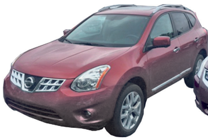
2013 Nissan Rogue SL

Quality Pre-Owned ONLY $18,499 Only 6600 Miles, #508578U