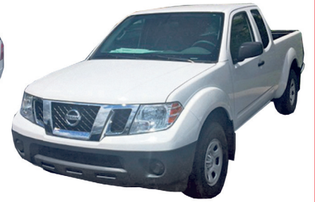
2012 Nissan Frontier