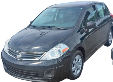
2012 Nissan Versa Sedan SL