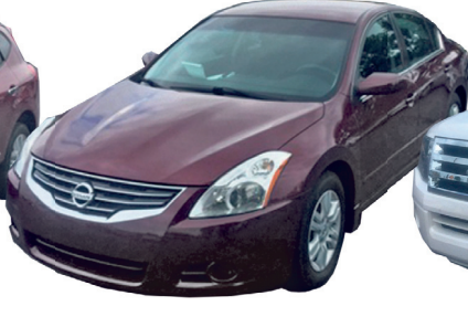
2011 Nissan Altima S

Quality Pre-Owned ONLY $18,499 Only 6600 Miles, #508578U