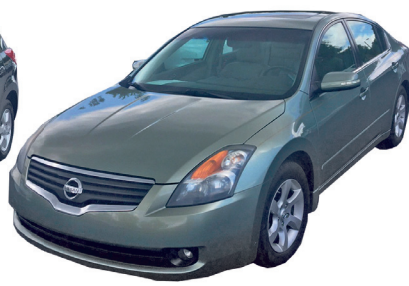
2008 Nissan Altima 3.5 SL