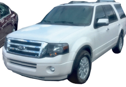
2014 Ford Expedition Limited