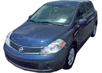
2012 Nissan Versa HB

Certified Pre-Owned ONLY $8,999 #801383U