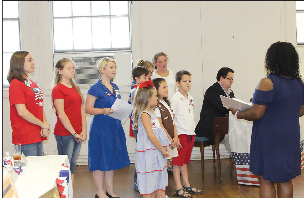
The YWCO community choir performed a "Music Salute to God and America."