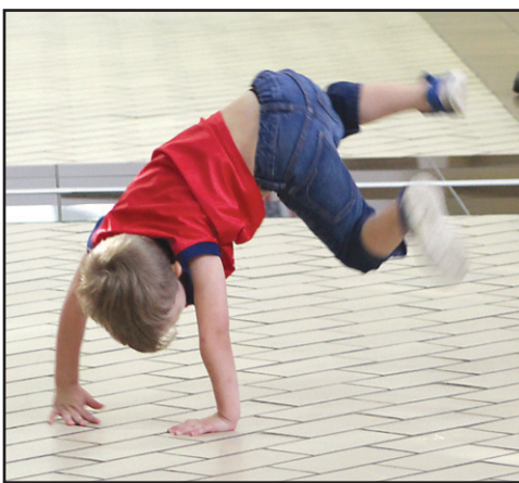
Cartwheeling to the music!