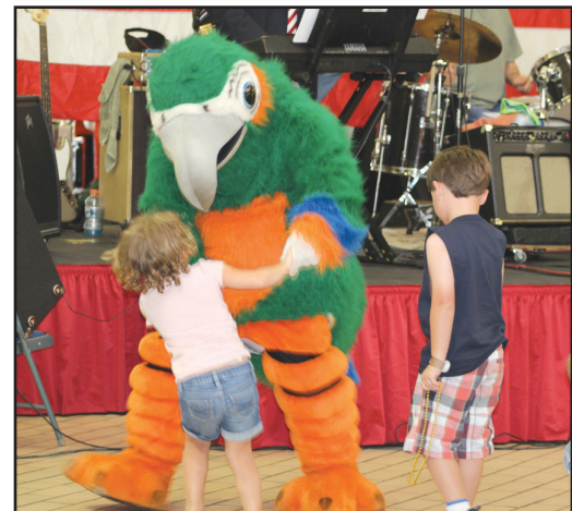
Mr. Parrot dances with the children.