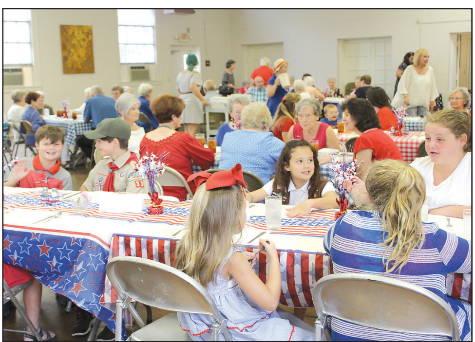
Folks of all ages gathered at the historic YWCO in downtown Laurel for the annual "Celebrate America" program.