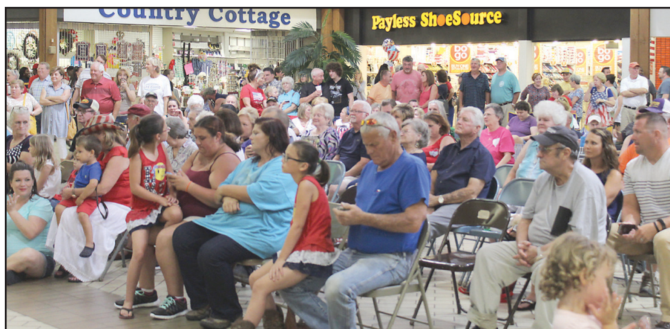
The Center Court of the Sawmill Square Mall was full of folks enjoying the music of The Classix.