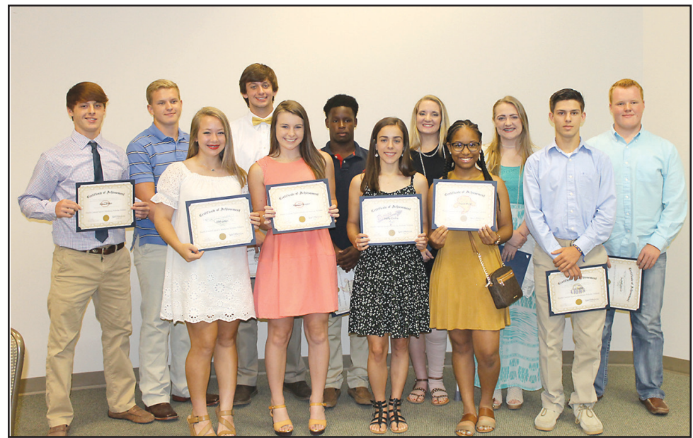
2017-18 Scholar Athletes