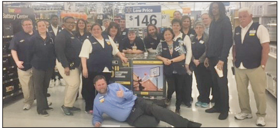
Through Walmart's "Fight Hunger. Spark Change," campaign, Maryland residents answered the call for help and generated $211,248.70 for the Maryland Food Bank to fight hunger between April 17 and May 15, 2017. The amount was $80,000 more than last year. (Pictured) The Walmart Management Team from the White Marsh Store in Baltimore County, Maryland.

"We thank all those who took part and helped provide meals for Marylanders in