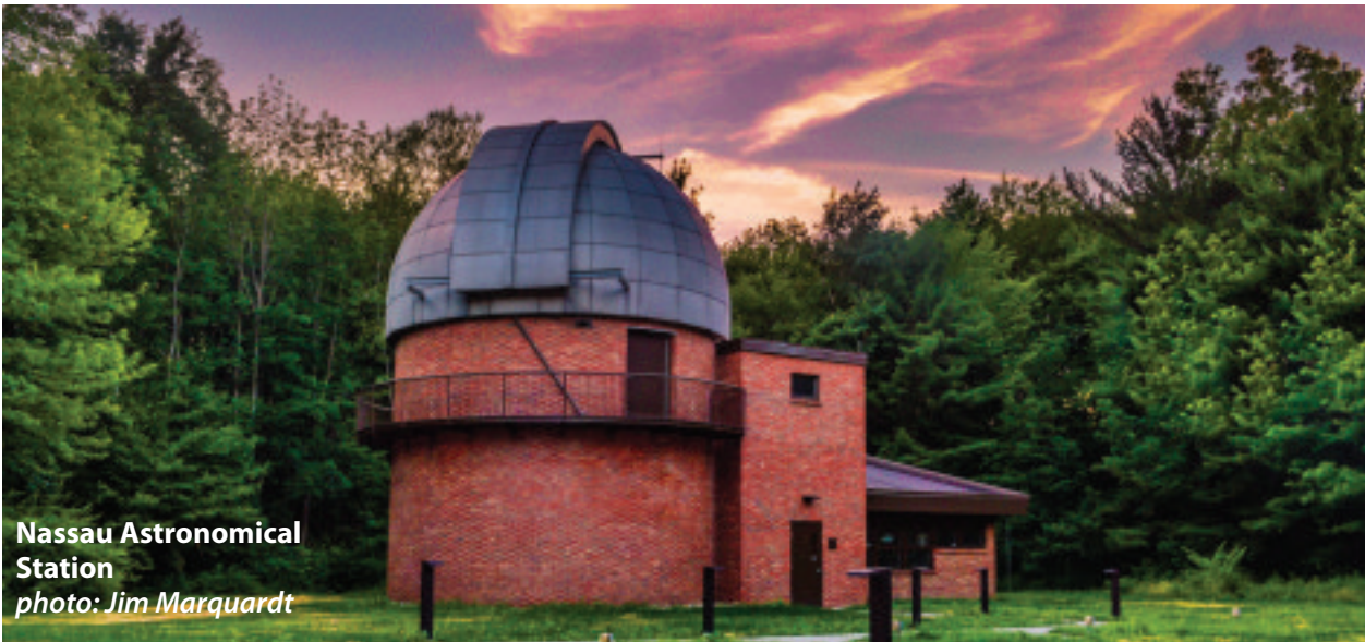
Nassau Astronomical Station