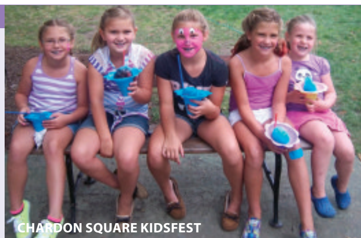
CHARDON SQUARE KIDSFEST