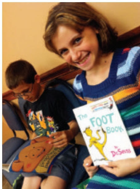
Reminiscing some unforgettable reads - 2014

Starting to read (and the love of reading) was by far one of the best 'first things' I have ever taught my kids and for sure the best time investment. By the time each one of them could walk they'd already stepped foot into a library