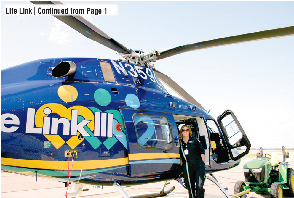
Lifelink helicopters are bright blue with light blue and yellow accents.