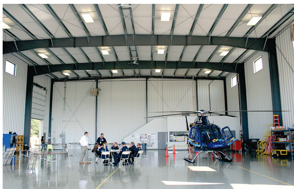
This roomy hangar will house two aircraft and crew supplies.