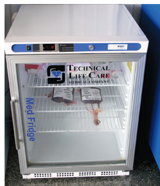
Fresh blood is kept in a small refrigerator in the Lifelink hangar.