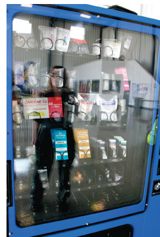
This secure vending machine contains drugs needed by critically ill patients.

Inside the hanger, a small refrigerator contains pints of blood. There is a U-capit, a sort of secure vending machine that dispenses drugs needed for such things as heart attacks, pain and high