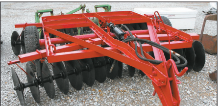
10' Int. transport disc. reconditioned, like new blades, full scrapes, w/cyl. $2,850