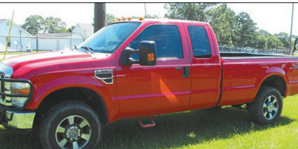
2008 Ford F350 Lariat, 4x4, 6.4 diesel, 6 speed, 268K miles, solid truck. $9,800