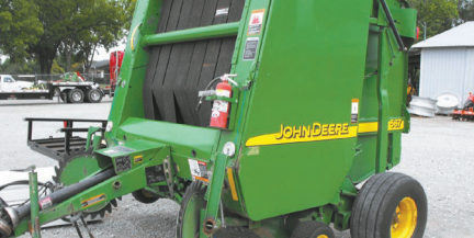
567 John Deere trailer w/monitor clean unit $9,500