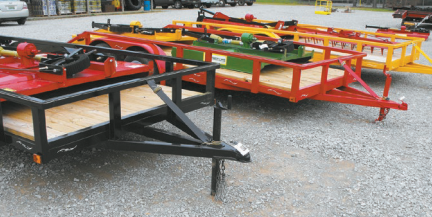
16' trailers w/ramps, NEW, Several instock $1,350