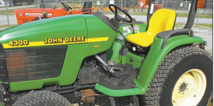
4300 John Deere, Hst, trans. power steering, 32 hp. $5,350