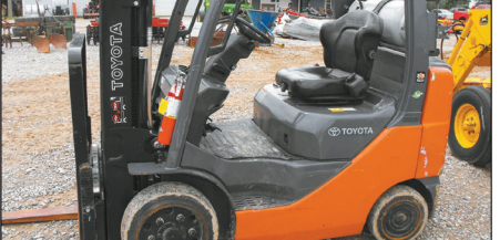
2014 Toyota fork lift, approx. 1,400 hrs. 3 stage mast, side shift, very nice $11,900