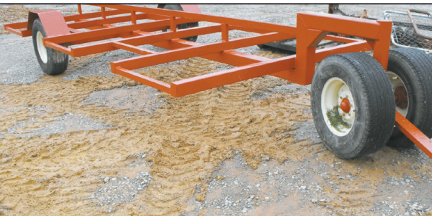
New 6 bale mover $2,350