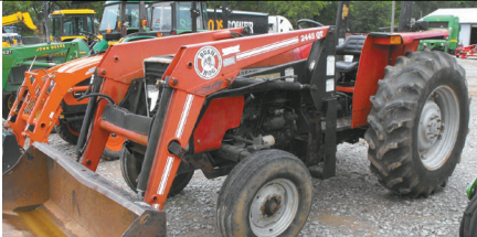
362 Massey Ferguson w/ Bush Hog Loader 1,800 hrs. $9,850