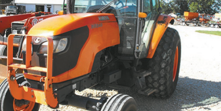
M8540 Kubota, C/A, 85 hp, new AG tires! $14,900