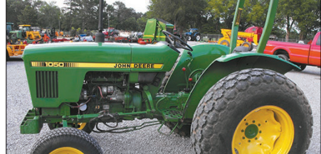
1050 John Deere, 37 hp, power steering, $3,950