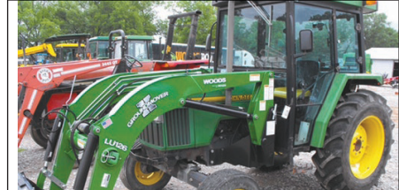
5200 John Deere, cab, new Woods loader $14,800