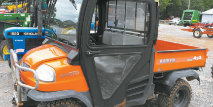
Kubota RTV 900 w/cab, 1,100 hrs. hyd. dump $6,850