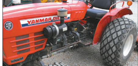
276 Yanmar, 4x4, power steering, power shuttle, 1,618 hrs. CLEAN $4,850