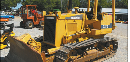
D37E-2 Komatsu dozer, 6 way, using on our farm! $15,900