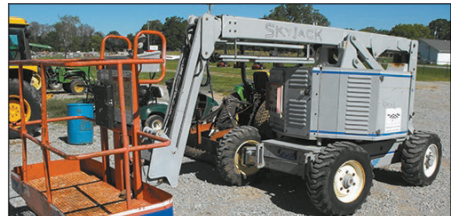
Skyjack SJKB40DF man lift, 40', dual fuel $8,500