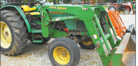
5300 John Deere w/521 loader, 3,600 hrs. $11,900