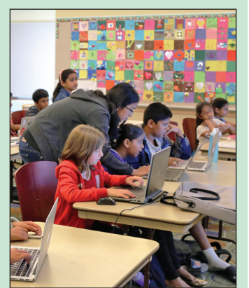
Code One Programming's first class at the local library.