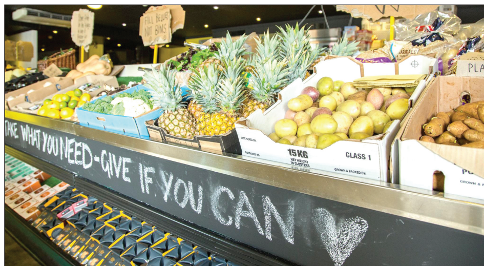
Ozharvest in Sydney, Australia features a pay-what-you-can model of commerce.