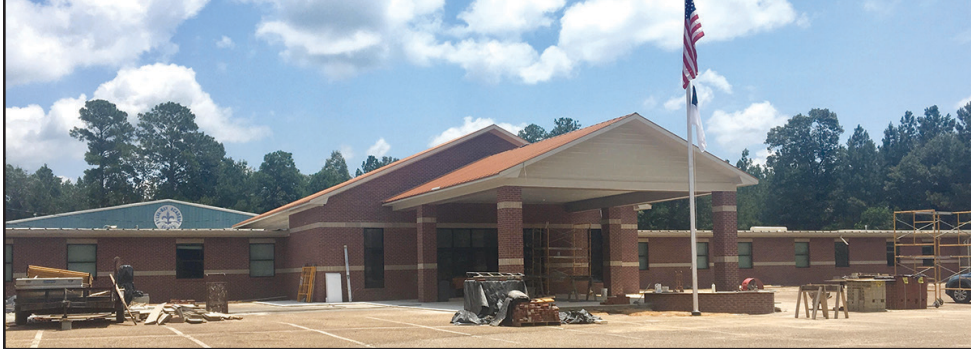
Renovations are being made at Sylva Bay Academy.

Holder gave an overview of the renovations being made to the SBA campus including its new main entrance and administrative offices. Holder provided an overview of the facility and its objective to provide more usable space as well as a more energy efficient and secure environment for staff and students. Following the dinner, Holder gave a tour of the new facilities. To become a member of the STEP Program or for information about Sylva-Bay Academy's K3 - 12th program, call (601) 764-2157.