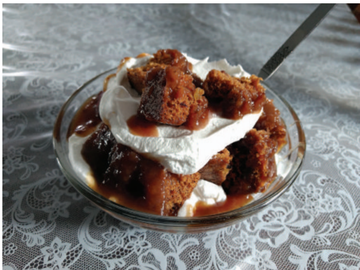
The 'famous Date Nut Pudding'

The show opens at 8am. Early buyers admission is $25. General Admission starts at 10am and runs until the show closes at 4:30pm for $8. For more info visit our website www.burtonantiquesmarket.com .