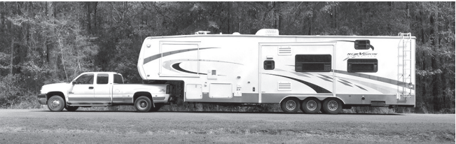
The Yerks' home on the road.