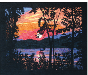
Lake Sunset III, 28" x 24" landscape quilt by Emily Chesick.

Scavenging her mother's fabric scraps to make no-sew garments for dolls and stuffed animals was Chesick's introduction to working with fiber. Over the years she continued to sew, often making her own clothing. In 2003 she took a landscape quilting class and was hooked on the process. Drawing on family vacations to national parks and other