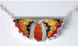
Flutterby, cloisonné enamels, rose cut carnelian, sterling and fine silver pin/pendant.

adelphia, with a year each in England and Switzerland. Her parents were a college