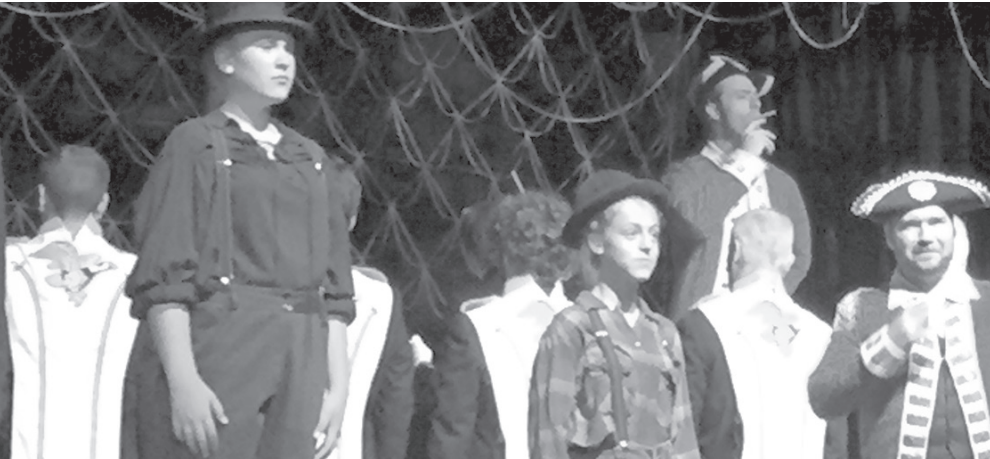
Lakes Area Music Festival has had performances in the Brainerd area for the last month. Here the opera Carmen is staged at Tornstrom auditorium.