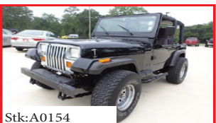
Stk:A0154 1994 JEEP WRANGLER S