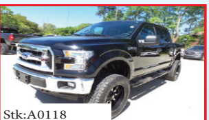
Stk:A0118 2016 FORD F-150