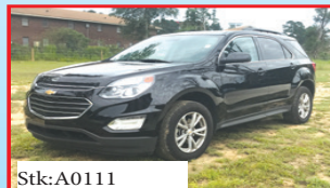
Stk:A0111 2017 CHEVROLET EQUINOX LT