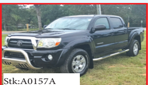
Stk:A0157A 2008 TOYOTA TACOMA PRERUNNER