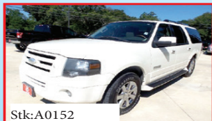
Stk:A0152 2007 FORD EXPEDITION EL LIMITED