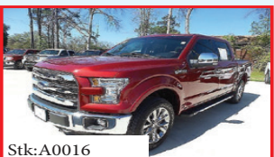
Stk:A0016 2015 FORD F-150 LARIAT