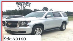
Stk:A0160 2017 CHEVROLET TAHOE LT