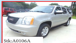
Stk:A0106A 2009 GMC YUKON XL