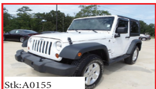
Stk:A0155 2013 JEEP WRANGLER SPORT