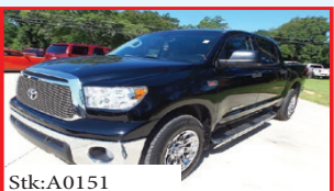
Stk:A0151 2011 TOYOTA TUNDRA 2WD TRUCK