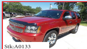
Stk:A0133 2013 CHEVROLET TAHOE LTZ