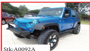
Stk:A0092A 2010 JEEP WRANGLER UNLIMITED