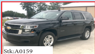
Stk:A0159 2017 CHEVROLET TAHOE LT