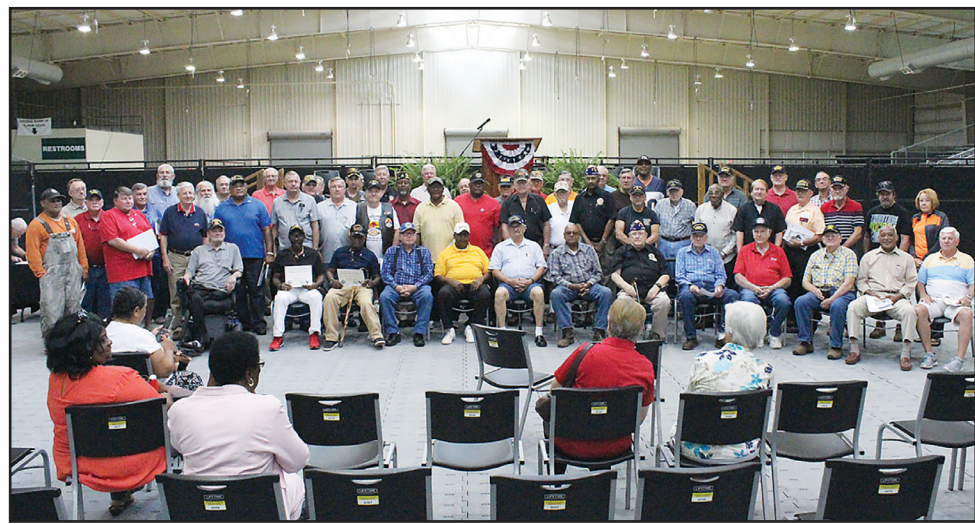
Approximately 78 Vietnam veterans from Jones County were honored at the program.