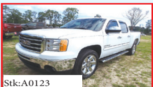
Stk:A0123 2013 GMC SIERRA 1500 SLE