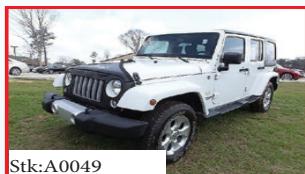
Stk:A0049 2014 JEEP WRANGLER UNLIMITED SAHARA