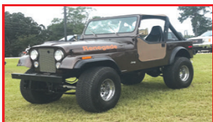
Stk:A0154 1979 JEEP RENEGADE