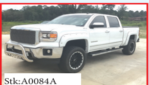
Stk:A0084A 2014 GMC SIERRA 1500 SLT