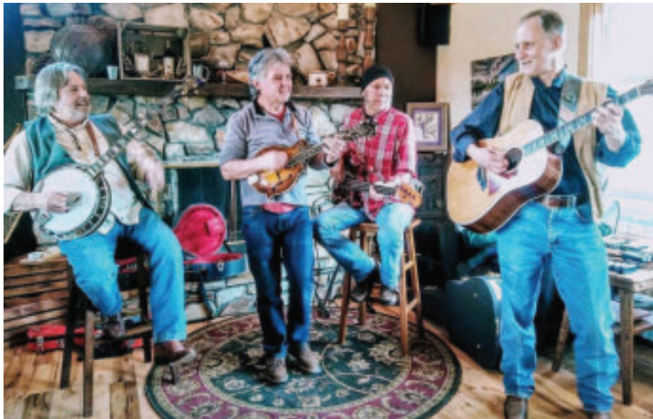
The Silver String Band

Saturday, September 16 & Sunday, September 17 at Lake Metroparks Farmpark