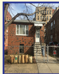
PELHAM BAY: 2116 COLONIAL AVE SOLD!