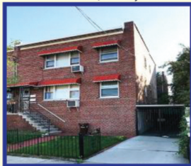
MORRIS PARK: 1832 BRONXDALE AVE BRICK 2 FAMILY HOME, 2 BR OVER 2 BR PLUS WALK OUT BASEMENT, PRIVATE DRIVEWAY, IDEAL LOCATION CLOSE TO STORES & TRANSPORTATION $775,000