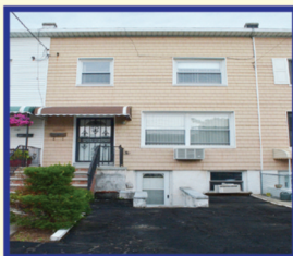
THROGS NECK: 243 BRINSMADE AVE SAY "HELLO" TO HOME! BRICK 1 FAMILY DUPLEX, 3 BRS, PELLA SLIDERS FROM KIT TO LARGE PATIO, HARDWOOD FLOORS THROUGHOUT, LARGE FINISHED WALK-IN IS IDEAL IN-LAW SUITE ASKING $449,000