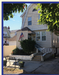
PELHAM BAY: 1463 GEORGE ST SOLD!