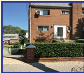
COUNTRY CLUB: 1520 MACDONOUGH PL A REAL SHOW OFF! BRICK 1 FAMILY DUPLEX, 1.5 BATHS, HARDWOOD FLOORS, IN LAW SUITE IN WALKIN & BSMT TOO! ASKING $509,000