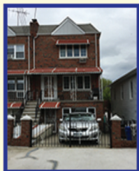
COUNTRY CLUB: 3190 FAIRMOUNT AVE SOLD!