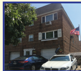
THROGS NECK: 2850 BRUCKNER BLVD BEAUTIFULLY RENOVATED HUGE BRICK 2 FAMILY SET ON CORNER LOT, 3 BR DUPLEX W/1.5 BATHS, OVER SPACIOUS 3 BR UNIT, LOTS OF CLOSETS, LARGE COMPLETELY FINISHED BSMT W/ HALF BATH & WET BAR ....LEADS TO 3 LEVEL PATIO & POOL IN YARD, GARAGE ASKING $749,000