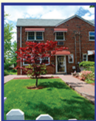
THROGS NECK: 1051 QUINCY AVE SOLD!