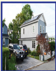
SILVER BEACH: 14 ELM PLACE IN CONTRACT!