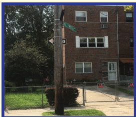
THROGS NECK: 501 HOLLYWOOD AVE OWN & EARN! BRICK 2 FAMILY SET ON CORNER PROPERTY, 3 BR DUPLEX W/ 2 BATHS, SLIDERS TO TERRACE, 1 BR WALK-IN & FINISHED BSMT TOO! ASKING $649,000