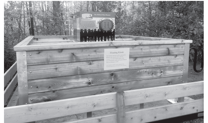
This floating kiosk will be anchored in Milford Lake, directly above "Mining Contract #13," the location where water broke through and flooded the Milford Mine on February 5, 1924.

In an effort to honor the miners, the Crow Wing County Board approved the Milford Mine Memorial Park concept in December of 2007. Phase 1 of the project was completed in 2010 and included an access road, parking area and walking path construction. In 2011, the Minnesota Historical Society listed the Park as a site on the National Registry of Historic Places. Projects included in 2012