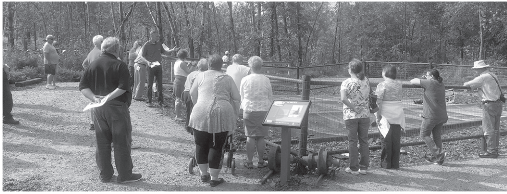
Visitors to the grand opening of the park view the site of the main mine shaft.

The Milford Mine Memorial Park grand opening was held on September 13 at Milford Lake, north of Crosby.