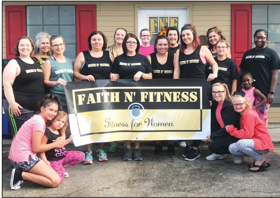
Faith N Fitness, located at 4127 Hwy. 15 North in Laurel, had their grand opening on September 12. Faith N Fitness is a fitness center for women and is located between USA High Speed Internet and Southern Styles Hail Salon. Their hours are 8:30 a.m. - 6:00 p.m. with 24/7 access for members. You can contact them at 601.319.1703 or via email at faithnfitness4127@gmail.com.