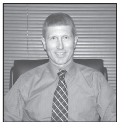
By Kevin Williamson

Apparently the Swedes are tiring of scanning tickets to board trains. Sweden's largest state-owned train operator is now allowing customers to board trains by having a microchip scanned, instead of buying tickets.