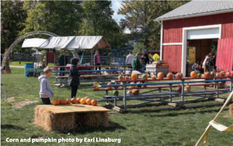
Corn and pumpkin