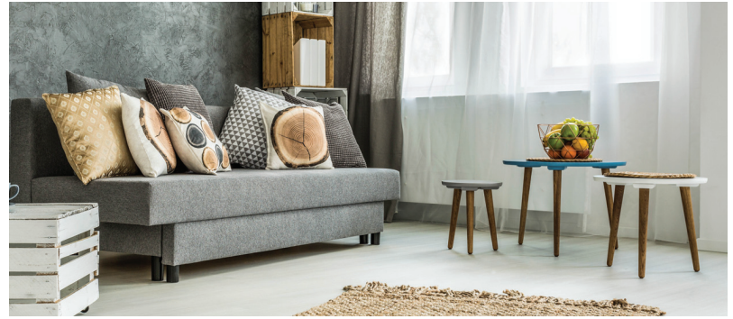
A trundle sofa bed enables overnight guests to sleep comfortably right in the living room or den.

Children tend to accumulate toys and games. And as kids grow from children to young adults, their list of must-have items — from video gaming systems to other electronics — grows along with them. Storage can make a room functional for both adults and children. Devote an entire wall to a closet or drawer system where toys can be stored out of sight when necessary. Storage ottomans can be used for extra seating while also providing somewhere for homeowners to stash stuffed animals or games for easy access. When choosing furniture, look for fabrics that are resistant to stains and modular pieces that can be moved around