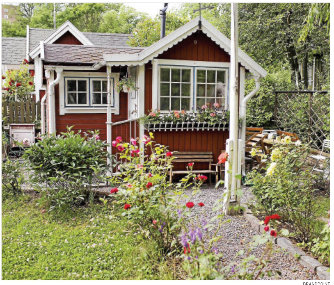
While newly constructed homes are bigger than ever, most Americans still live in modestly sized or even small houses and many of these owners are choosing to remodel rather than move into a bigger home.

can solve a number of smallspace challenges. For example, you may decide to add a powder room in the unused space beneath a stairway. However, if the space toilet with water tank and traditionally plumbed sink might not fit. In such a situ-