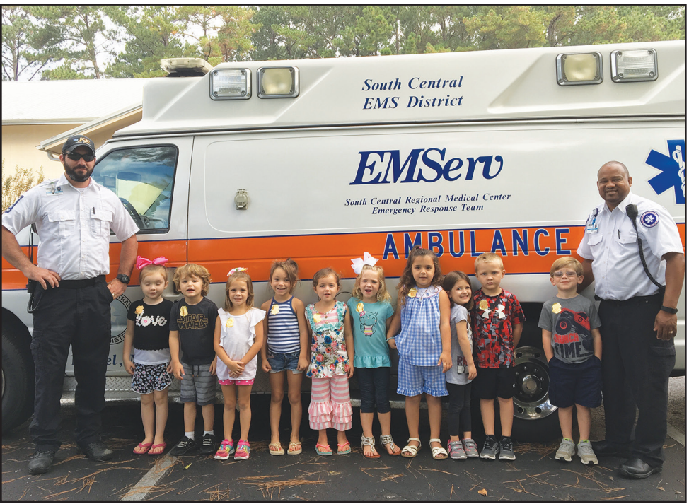
Laurel Christian School preschool students hosted emergency responders from EMServ recently. The students want all of the area's emergency responders to know that they really appreciate them.