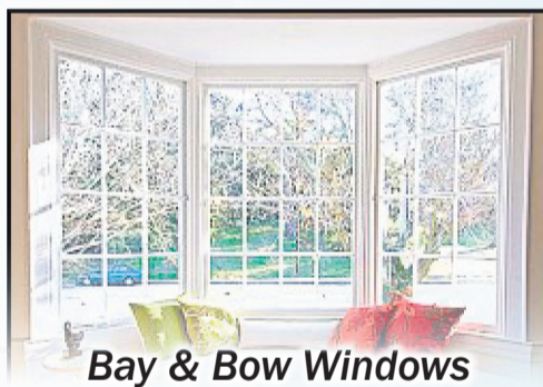
Bay & Bow Windows

That's Why Over 39,000 Homeowners Have Chosen Paramount