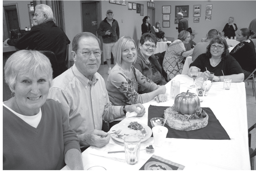
Diners enjoyed sampling food from area restaurants and a market at the Moose Lodge in Aitkin for a Taste of Aitkin on October 5.

By ANN SCHWARTZ After a long stretch of cool and rainy weather, the sun