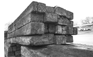
USED RAILROAD TIES. THE STONE DEPOT, $13.50 EACH. (931)684-1412.