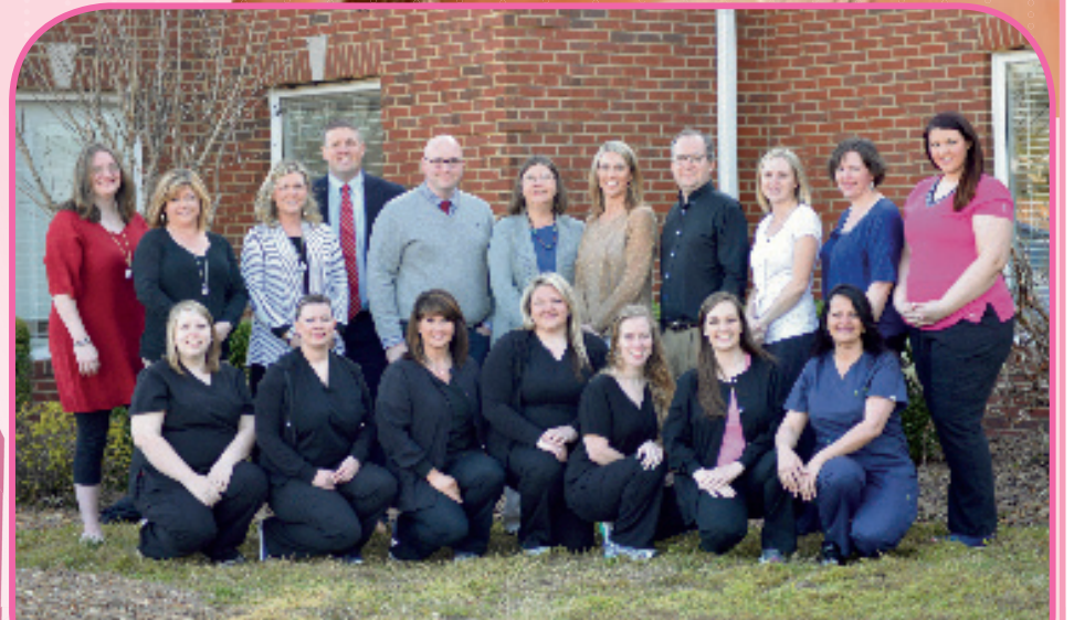
Premier Women's Health Staff