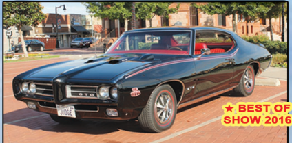
Ken Smith's 1969 Pontiac GTO