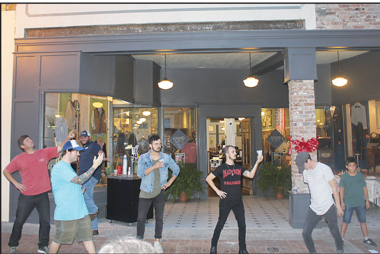
The Guild and Gentry Mannequin Contest.