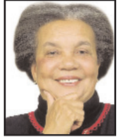
Marian W. Edelman

A s congregations of all faiths are observing the National Observance of Children's Sabbaths® Celebration this weekend, "Moving Forward with Hope: Love and Justice for Every Child," I offer prayers for all child advocates in this very challenging time for children and families and all of us when a half century of struggle