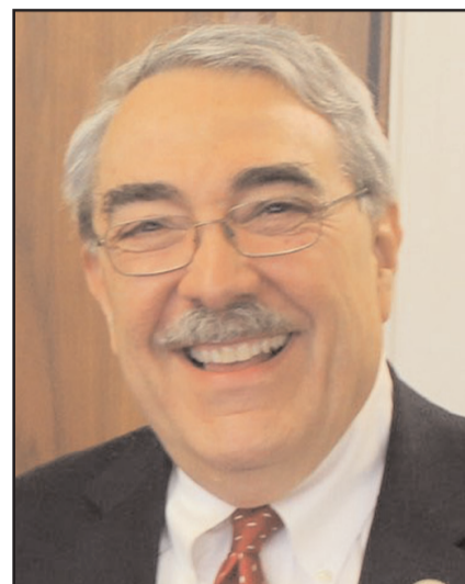
CONGRESSMAN G.K. BUTTERFIELD