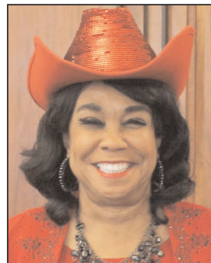
CONGRESSWOMAN FREDERICA WILSON