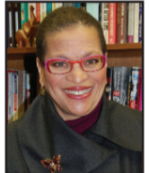
Dr. Julianne Malveaux

I never thought I would miss our 43rd President, George W. Bush. And I've never much thought of him as a great, or even good, speaker. But the speech he gave at a conference convened by the George W. Bush Institute was simply eloquent, excellent, thoughtful, and compelling. After keeping a low profile for the past eight years, he spoke up to deny the fact that "bigotry emboldened". "Bullying and prejudice in our public life sets a national tone, provides permission for cruelty and bigotry, and compromises the moral education of children".