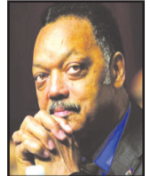
Rev. Jesse Jackson, Sr.

Contrary to Donald Trump, McCain is a true American hero. Shot down over North Vietnam in 1967, he was seriously injured and captured by the North Vietnamese. He was tortured after he refused an offer to be repatriated ahead of other captives who had been held longer. Instead, he stayed with his fellow prisoners for five long, painful years. After he retired from the Navy, McCain was elected first to the U.S. House of Representatives and then to the Senate in 1987.