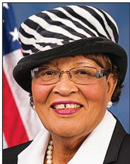
CONGRESSWOMAN ALMA ADAMS