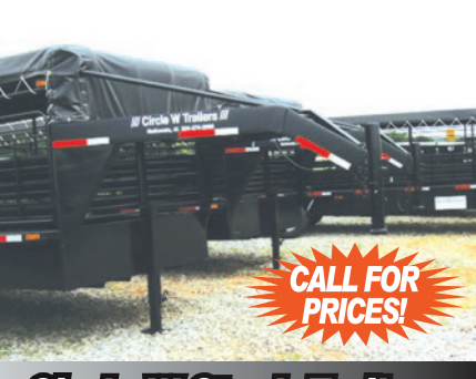
Circle W Stock Trailers Many Sizes To Choose From