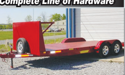
Custom Car Hauler