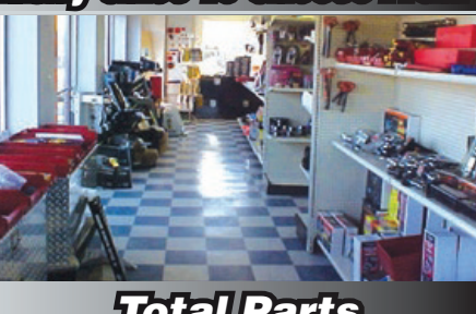
Total Parts & Accessories