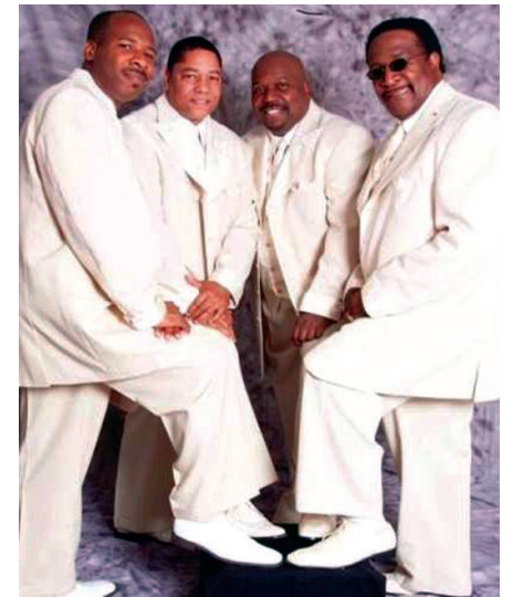
The Dynamic Superior will perform at the 1st Annual Royal Theatre Reunion Show on Saturday, November 11 from 8 p.m. until 1 a.m. at the Patapsco Arena, 3301 Annapolis Road in Baltimore. For tickets call 410-905-4695.