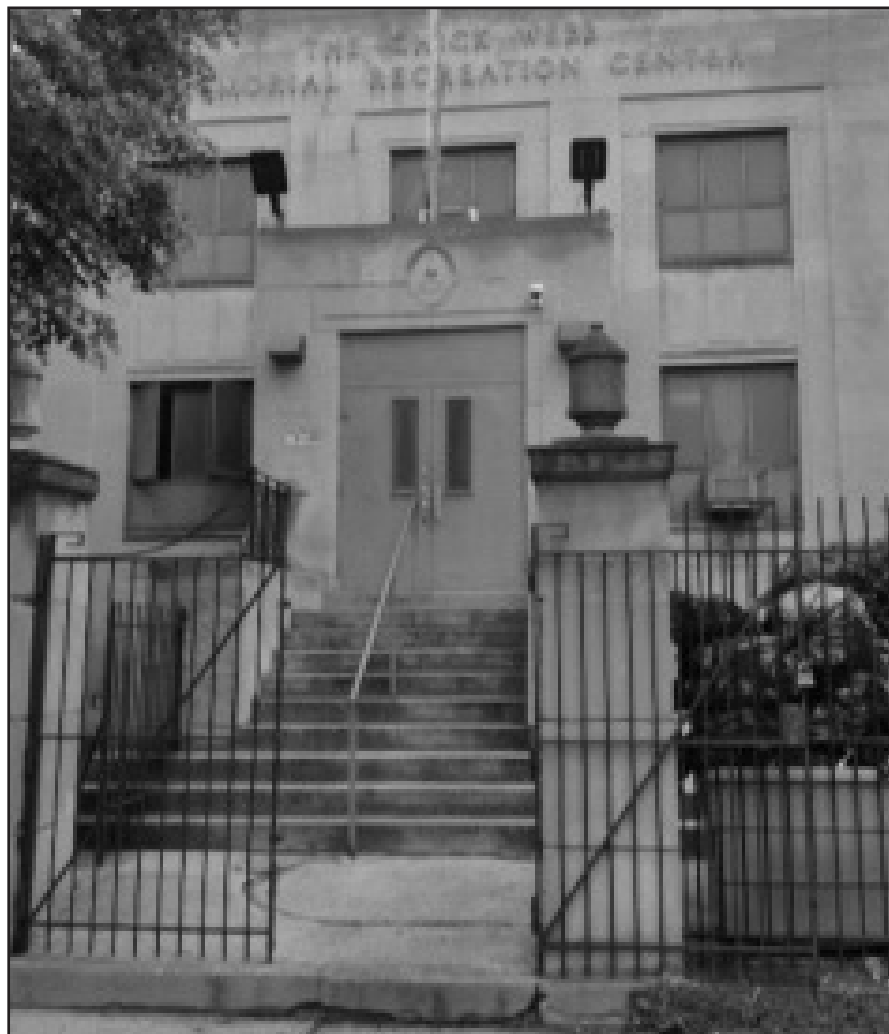
On Saturday, November 17, 2017, the Dunbar Coalition in partnership with Change4Real Development Corporation Inc., and Baltimore City Department of Recreation and Parks will celebrate the dedication of the Chick Webb Memorial Recreation Center as a historic landmark.

Residents viewed the center as a venue to provide recreational activities and to inspire youth by commemorating Webb,