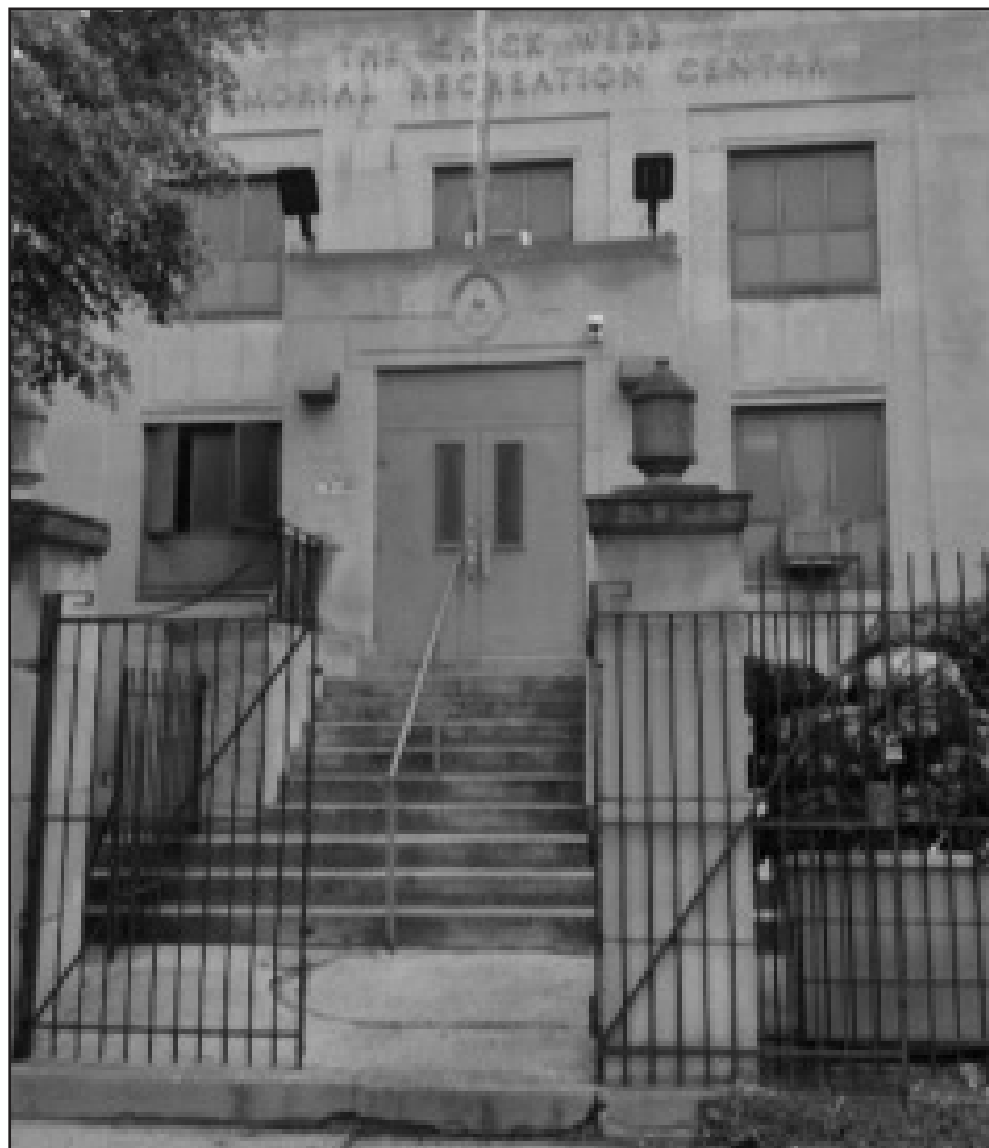
On Saturday, November 17, 2017, the Dunbar Coalition in partnership with Change4Real Development Corporation Inc., and Baltimore City Department of Recreation and Parks will celebrate the dedication of the Chick Webb Memorial Recreation Center as a historic landmark.

Residents viewed the center as a venue to provide recreational activities and to inspire youth by commemorating Webb,