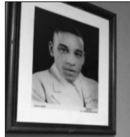
Photograph of Chick Webb, which that hangs on the wall in Chick Webb Memorial Recreation Center.

The committee formed by advocates of the center held a benefit, which attracted