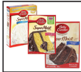
Betty Crocker cake mixes, 15.25 oz. yellow, white or chocolate fudge 89¢