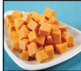
5 lb. bag Cubed Cheddar Cheese $7.99