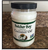
Butcher Boy coconut oil, 1 gal. $11.99