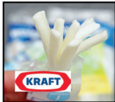
Kraft String Cheese, 24 ct. box $2.99