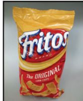
Frito's Corn Chips, 16 oz. 99¢