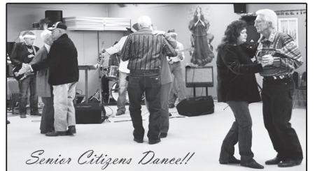
Senior Citizens Dance!!