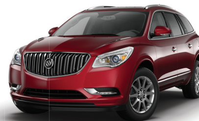
2017 BUICK ENCLAVE LEATHER

THAT'S 25% BELOW MSRP ON THIS ENVISION ESSENCE