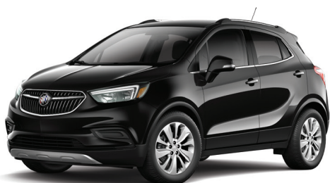
2017 BUICK ENCORE ESSENCE

25% BELOW MSRP 1 ON MOST 2017 BUICK LUXURY SUV MODELS