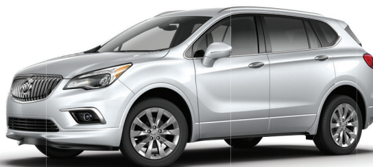
2017 BUICK ENVISION ESSENCE

THAT'S 25% BELOW MSRP ON THIS ENCORE ESSENCE