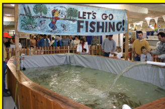
Catch Rainbow Trout!