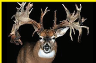
See Huge Deer Mounts

IT'S THE BIGGEST 3 DAY BOAT & RV SALES EVENT OF THE YEAR!