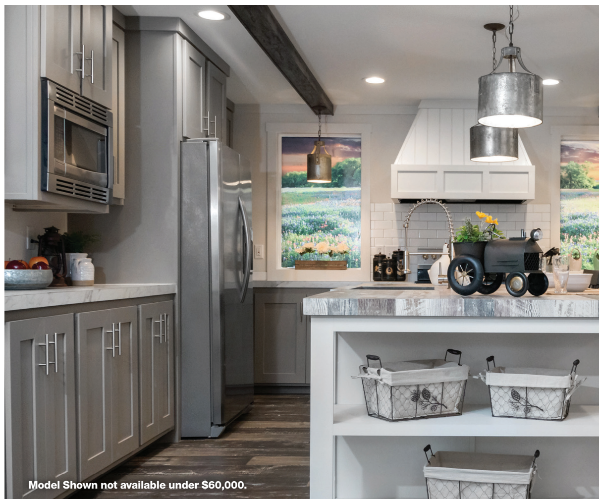
Model Shown not available under $60,000.

New Energy Smart homes starting under $60,000* Plus required delivery and installation File in Style Tax Season Sale