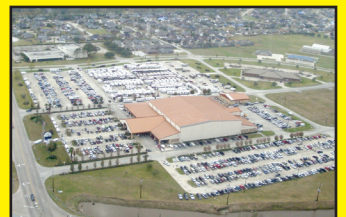
The Largest Boat & RV Sale in the Region!

See What's New for 2018! Over 100 Brands of Boats & RVs on Display!