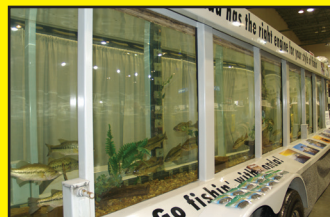
Watch Bass Strike Lures!