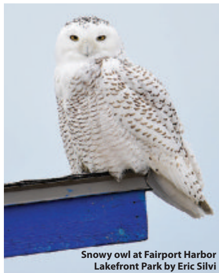
Snowy owl at Fairport Harbor Lakefront Park

If you are lucky enough to see a snowy owl, take some time to observe it. Notice the black marks on its feathers; juvenile