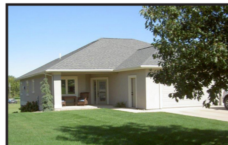
1007 Hoeven Dr, Alton • $325,000