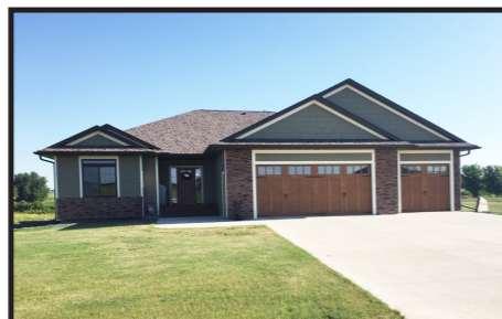
1015 Hoeven Dr, Alton • $449,000