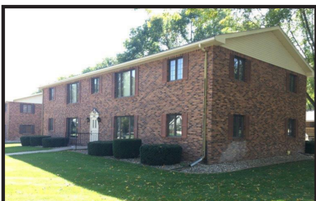
602 2nd St SE • $725,000