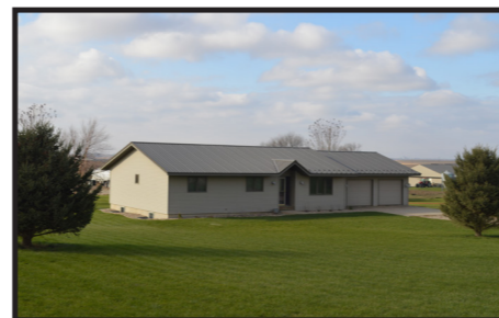
4367 Indian Ave • $224,900