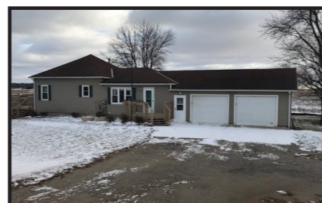
3567 440th St • $123,500