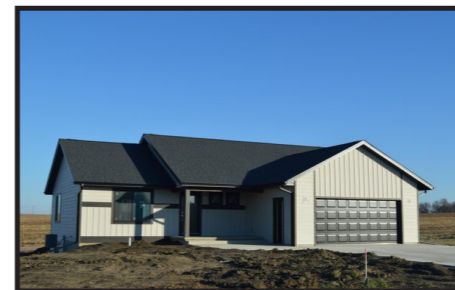
1303 Providence Pl SE • $219,000