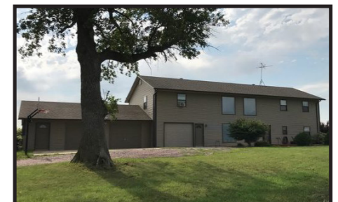
4199 440th St, Alton • $255,000