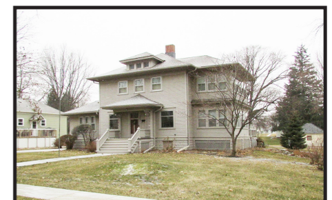
321 1st St NE • $182,900