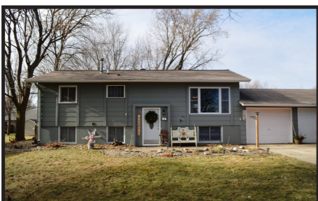
106 Louisiana Ave SW • $179,900