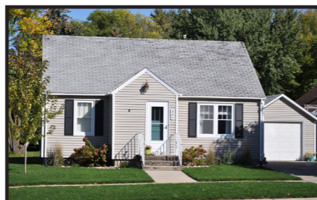
409 4th St NW • $127,000