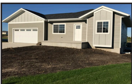
1302 Madison Pl SE • $239,900