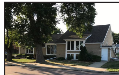
317 8th St • $260,000