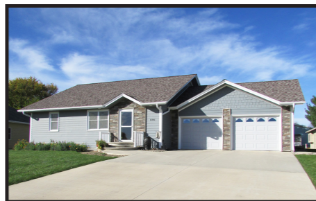
1106 Denver Pl SE • $235,000