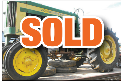
320 John Deere, out of a local estate, down exh., weld on block (not leaking) $3,500