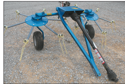
NEW! 2 basket tedder, only one left at this price! $1,595