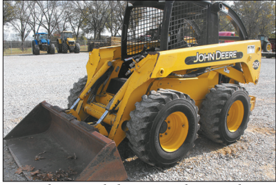
280 John Deere skid steer, 7,277 hrs. very clean, runs works good $12,900