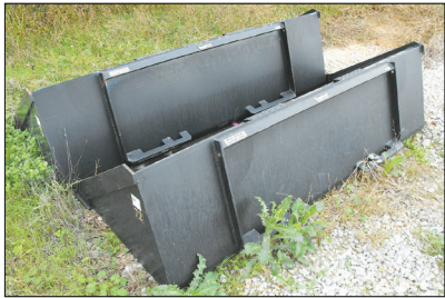
New 72" skid steer buckets $495.00