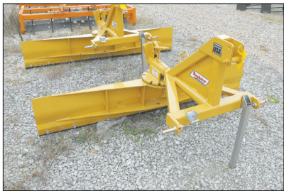
King Kutter 7' HD angle/swivel/tilt blades $475.00