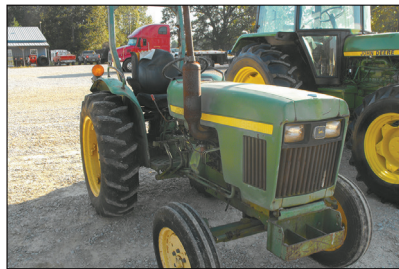
950 John Deere, starts & runs good (engine has blow-by) $2,950