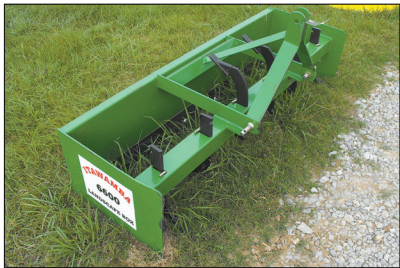
New 72" HD box blade w/teeth $550.00