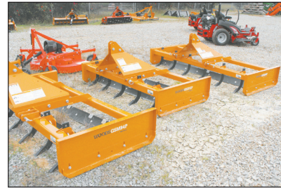
Woods grading scrapers w/teeth 6', 7' and 8' instock