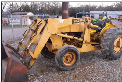
445C Ford, w/3pt., ind. pto and loader 2453 hrs $7500