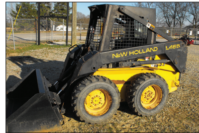
L465 New Holland Skid steer, 8120hrs, good condition for age and hrs. $6950