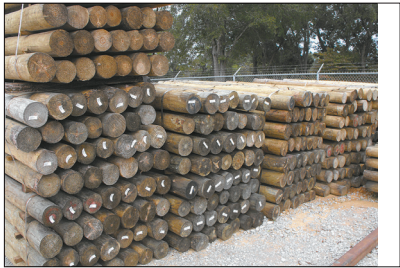
6"X8" treated fence post (bundles of 28) $11.50 per post