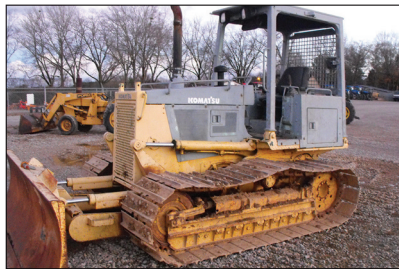
D38P Komatsu Dozer, w/6 way blade, joy stick controls, 2756 hrs $15,900