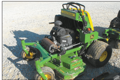
648R John Deere Commercial stand on mower like new, 365 hrs. $4,450