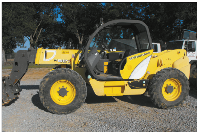
M427 New Holland Telehandler, only 668 hrs. using every day! one of a kind $44,500