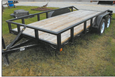
New 16' trailers, w/ramps, 3,500 lb. axles, no brakes $1,275