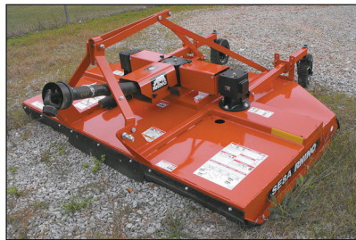
SE8A Rhino rotary cutter, 3 pt, new $4,750