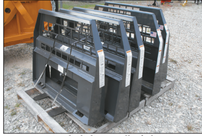
Woods skid steer pallet forks $695.00