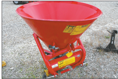
New Cosomo model 500 3pt spreader w/agitator $450.00