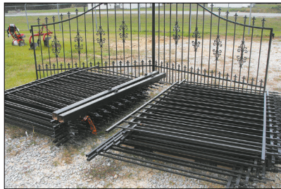
7' wrought iron fence panels (28 total) w/16' gates w/post, all for $3,350