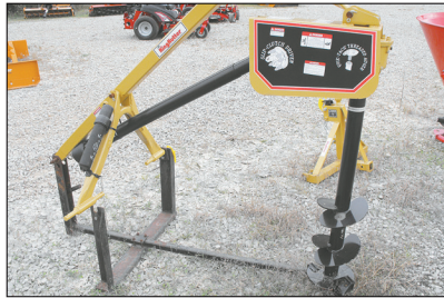
King Kutter 9' post hole digger, new $750.00