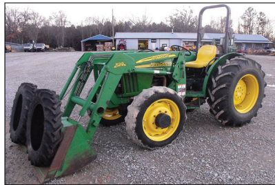
5105 John Deere 4x4, w/522 ldr., 1,376 hrs. clean $17,900