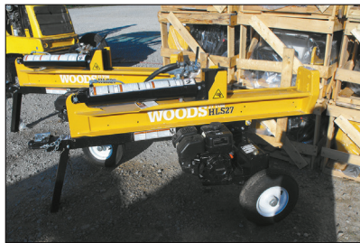
New! HLS Woods wood splitter, horizontal/vertical 27 ton, w/warranty $1,095