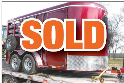
Delta 2 horse trailer, 2016 model, new! Very Nice! $3,900