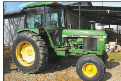
2140 John Deere, c/a, (same as 2750) 7,582 original and clean!! $12,900