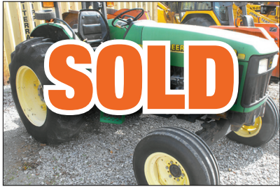
5210 John Deere, remote, 85% tires, original and very clean $9,850