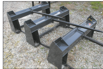
Woods skid steer bale spear, heavy duty, new $450.00