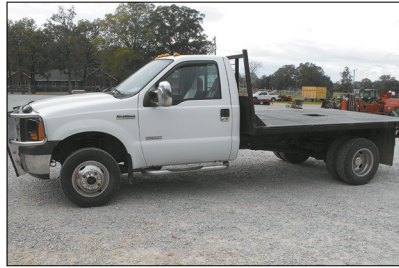
2007 Ford F350 4X4, auto, diesel, flat bed, 186,000 miles $9,850