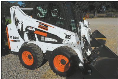
S590 Bobcat, C/A, 2015 model, one owner, 966 hrs. $34,500