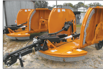
BW12 Woods batwings, new with warranty $9,850