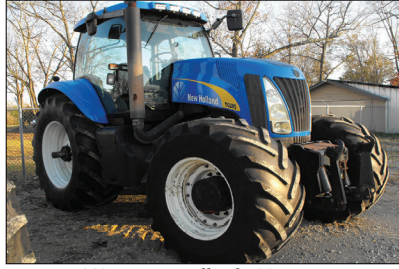
TG285 New Holland, C/A, 4x4 $49,500