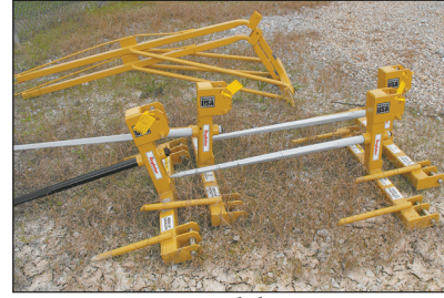
King Kutter 3pt bale spear, new $245.00