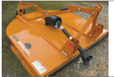
BB72 Woods rotary mower w/clutch, new $2,195