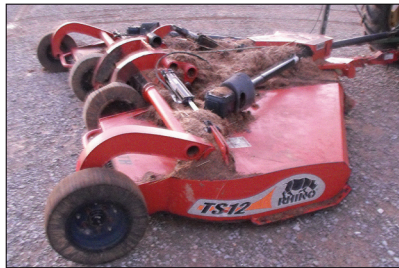
TS12 Rhino Cutter little ruff but we have just mowed 50 acres $4850