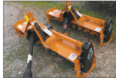
72' woods or Rhino rotary tiller w/clutch, new, REDUCED, $1,795