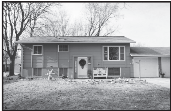
106 Louisiana Ave NW • $179,900