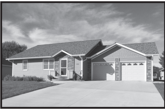
1106 Denver Place SE • $235,000

Thursday, January 18 from 4:30 to 6:30pm