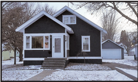
216 5th St. NE Orange City Hosted by Dale Pluim