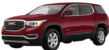
2018 GMC ACADIA