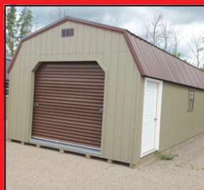
14x28 High Barn 3 Windows, 8x7 Roll Up Door, 1 Entry Door, 8 Ft. Loft