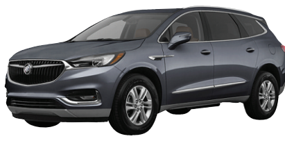
2018 BUICK ENCLAVE