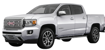
2018 GMC CANYON EXTENDED CAB 4X4

PER MONTH 36 MONTHS $2500 DUE AT SIGNING 1