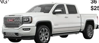
2018 GMC SIERRA 1500 DOUBLE CAB 4X4

PER MONTH 36 MONTHS $2500 DUE AT SIGNING 1