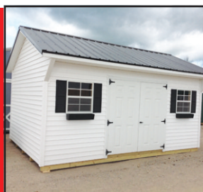
12x16 Quaker 2 Windows