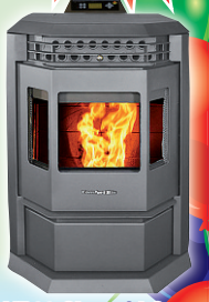
HP22 Charcoal Grey