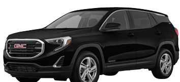
2018 GMC TERRAIN

PER MONTH 36 MONTHS $2500 DUE AT SIGNING 1