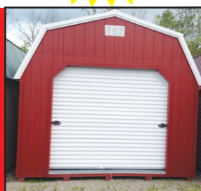
12x24 High Barn 1 Window, 3 Ft. Entry Door, 8x7 Roll Up Door, 8 Ft. Loft