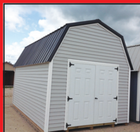
10x16 High Barn 1 Window, 8 Ft. Loft

Statewide Delivery - Free Delivery w/ in 70 miles!