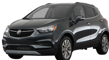
2018 BUICK ENCORE

PER MONTH 36 MONTHS $2500 DUE AT SIGNING 1-2