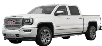
2018 GMC SIERRA 1500 CREW CAB 4X4