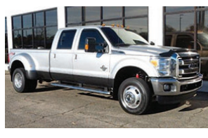
2016 FORD SUPER DUTY F-350 DRW LARIAT STK# 17UT719