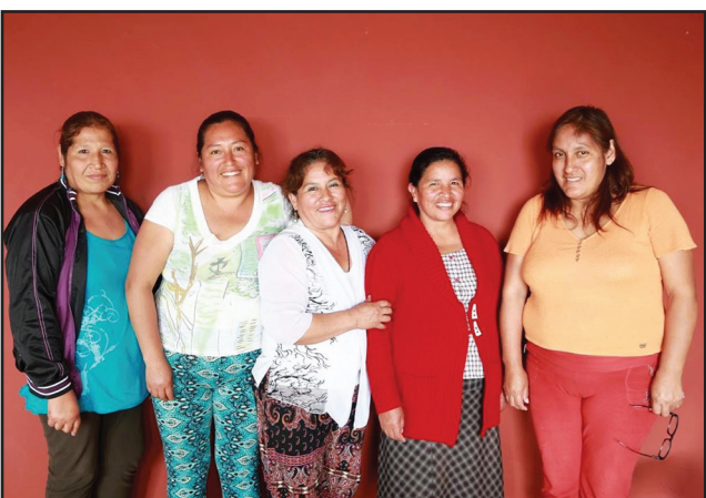
Here are the five women from Collique, Peru who create the Collique Cuffs.

of two children. She holds a degree in philosophy from Belmont University in Nashville, Tennessee. She will share how her mission has now become a permanent mission and the impact it has had on the lives of all involved. For more information contact the YWCO at 601-428-5694.