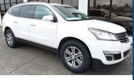
2015 CHEVROLET TRAVERSE LT