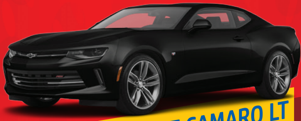
2017 CHEVROLET CAMARO LT