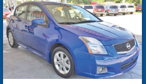
2012 NISSAN SENTRA 2.0 SR