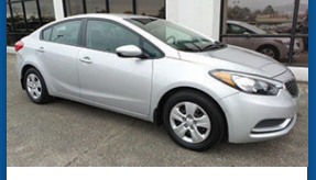
2015 KIA FORTE LX