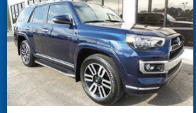
2016 TOYOTA 4RUNNER LIMITED