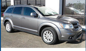
2013 DODGE JOURNEY SXT