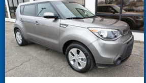
2016 KIA SOUL BASE