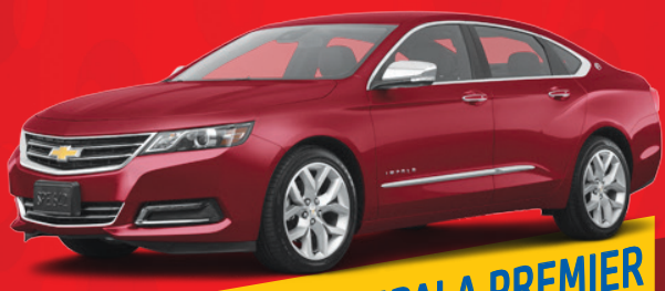
2017 CHEVROLET IMPALA PREMIER