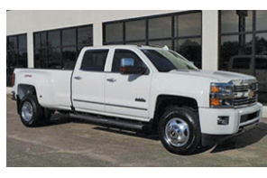
2015 CHEVROLET SILVERADO 3500HD HIGH COUNTRY STK# 17UT622