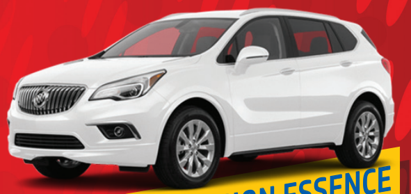
2017 BUICK ENVISION ESSENCE