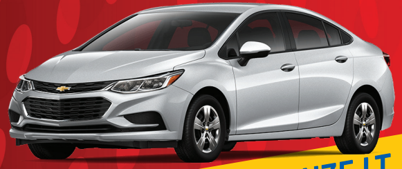
2017 CHEVROLET CRUZE LT

Your #1 GM Certified Dealer In South Mississippi!