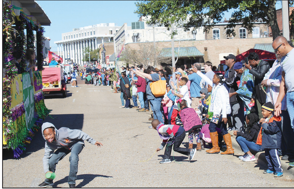
The streets of Laurel were lined last year for the first FOP Krewe of Blue Mardi Gras parade with folks yelling, "Throw me something Mister!"