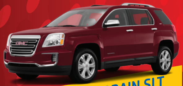
2017 GMC TERRAIN SLT