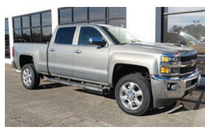
2017 CHEVROLET SILVERADO 2500HD LTZ STK# 17UT680