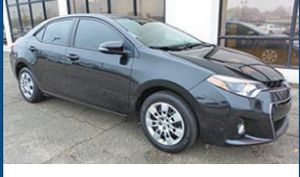
2016 TOYOTA COROLLA S