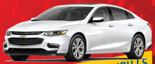
2017 CHEVROLET MALIBU LS