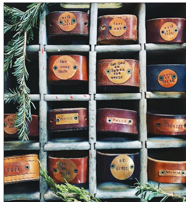
Collique Cuffs are created by women in Collique, Peru, and spread "words of hope" around the world.