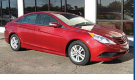
2014 HYUNDAI SONATA GLS