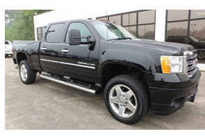
2014 GMC SIERRA 2500HD DENALI STK# 17UT615