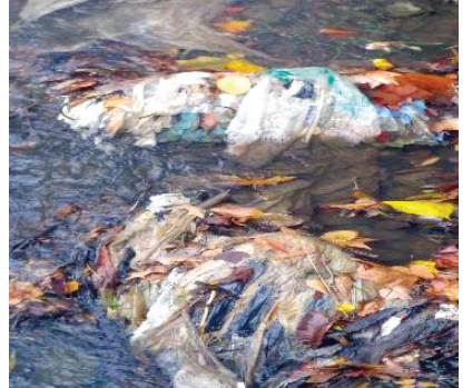
Bottles and Styrofoam, Roof Tar, Cans, Plastic Lawn Ornaments,