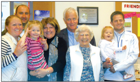
Members of the Butt and Streett families also attended the dedication ceremony.

After the plaque was unveiled, community members were treated to cookies and other light refreshments as they