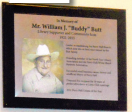
The new plaque hangs on the wall just inside the library's front door.

"We thank everyone for coming out - see PLAQUE on page 7-