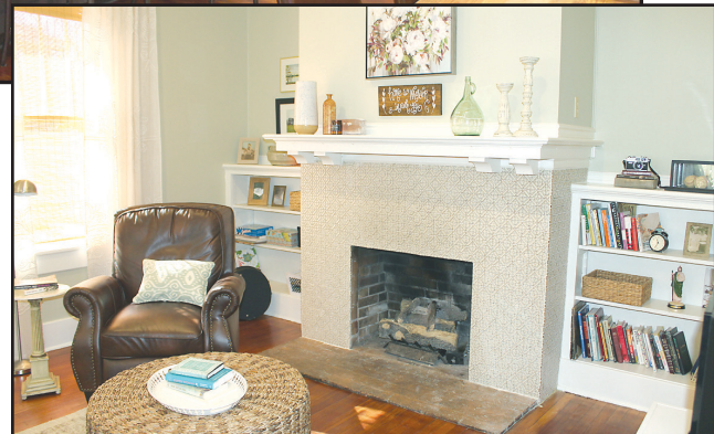
Erin chose a pale mint-green color for the living room and gave the fireplace a facelift with Spanish tile and a new mantle.