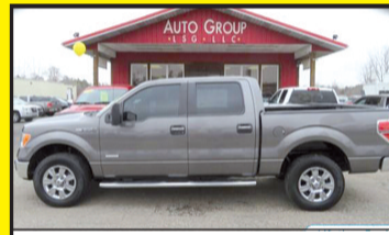
2012 FORD F-150 XLT 4WD $19,995