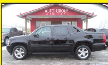
2012 CHEVROLET AVALANCHE LT 4WD $23,995