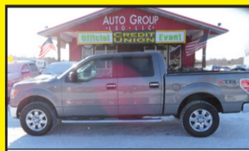
2011 FORD F-150 XLT 4WD $17,900