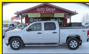
2011 GMC SIERRA 1500 SLE 4WD $21,900