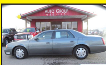
2005 CADILLAC DEVILLE SEDAN $5,995