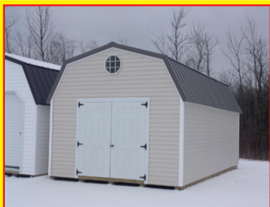
12x20 High Barn 2 Window, 8 ft. Loft $4,150

STOP BY OUR LOT AND CHECK OUT THE GREAT SELECTION OF BUILDINGS ON THE LOT - READY TO GO! INVEST YOUR TAX RETURN ON A BUILDING YOU CAN ENJOY FOR YEARS TO COME!!