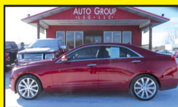
2013 CADILLAC ATS 3.6L LUXURY AWD $20,995