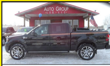
2008 FORD F-150 AWD HARLEY-DAVIDSON $17,995