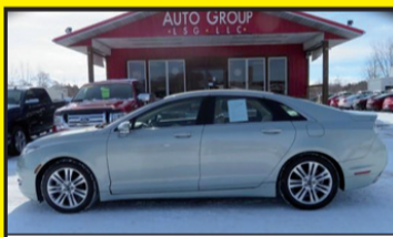
2013 LINCOLN MKZ HYBRID SEDAN $19,995