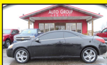
2008 PONTIAC G6 GT CONVERTIBLE $7,995