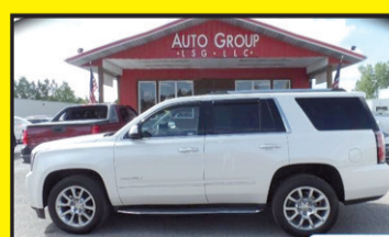
2015 GMC YUKON DENALI 4WD $42,400