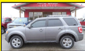
2012 FORD ESCAPE LIMITED 4WD $11,600