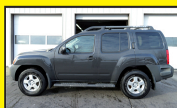
2008 NISSAN XTERRA 4WD $8,995