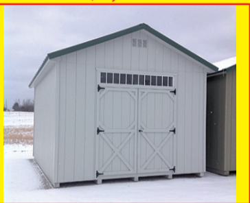
12x16 Gable 4 ft. Loft 1 Window $3,168

Statewide Delivery - Free Delivery w/ in 70 miles!