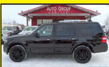
2013 FORD EXPEDITION LIMITED 4WD $26,995