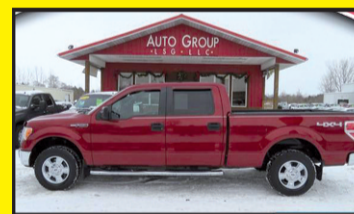
2013 FORD F-150 XLT 4WD $22,900