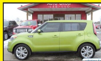
2016 KIA SOUL + $13,900