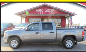
2007 GMC SIERRA 1500 4WD SLE $16,995