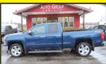
2015 CHEVROLET SILVERADO 1500 LS 4WD $22,995