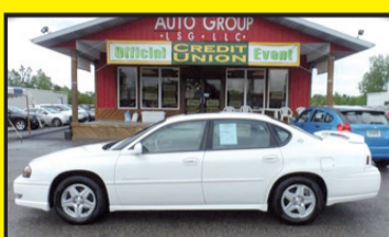
2004 CHEVROLET IMPALA LS $4,995