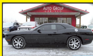
2016 DODGE CHALLENGER SXT PLUS $23,995