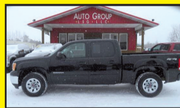
2012 GMC SIERRA 1500 SLE 4WD $21,900