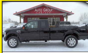
2008 FORD F-250 SD XLT 4WD $19,900