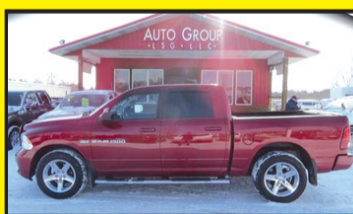
2012 RAM 1500 SPORT 4WD $23,600