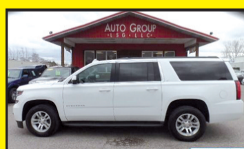
2017 CHEVROLET SUBURBAN LT 4WD $41,900