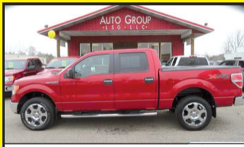
2010 FORD F-150 XLT 4WD $17,995