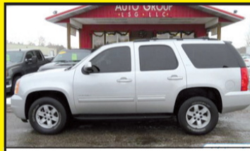
2010 GMC YUKON SLT1 4WD $19,700