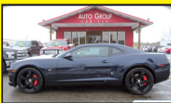
2011 CHEVROLET CAMARO 1SS COUPE $19,995