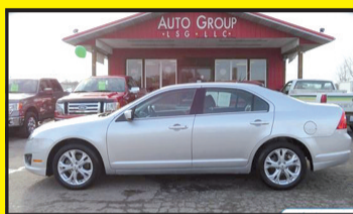
2012 FORD FUSION SE $11,995