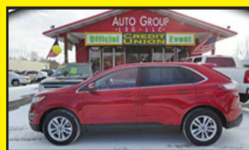
2015 FORD EDGE SEL AWD $24,700