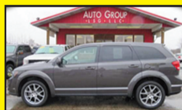
2016 DODGE JOURNEY R/T AWD $21,800