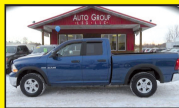
2009 DODGE RAM 1500 SLT 4WD $16,995