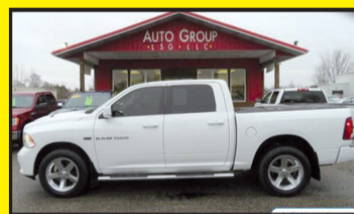
2012 RAM 1500 SPORT 4WD $22,495