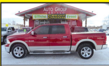
2010 DODGE RAM 1500 4WD $17,900