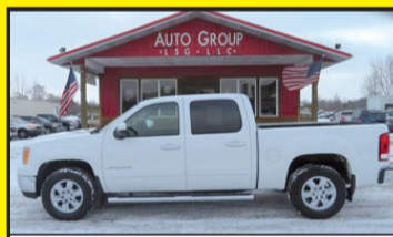
2009 GMC SIERRA 1500 SLT 4WD $20,900