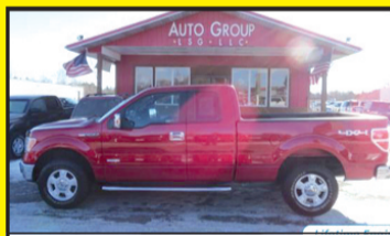
2012 FORD F-150 XLT 4WD $21,895