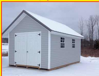
10x16 Chalet 2 Windows $3,340