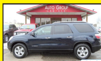
2008 GMC ACADIA SLE-1 FWD $10,995