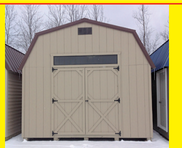
12x28 High Barn 8 ft. Loft, 1 Window $4,680