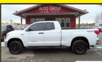
2013 TOYOTA TUNDRA SR5 4WD $24,995