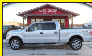
2011 FORD F-150 XLT 4WD $17,900