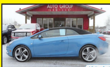
2017 BUICK CASCADA SPORT TOURING $29,995