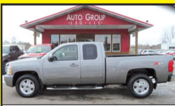
2008 CHEVROLET SILVERADO 1500 LTZ 4WD $16,995