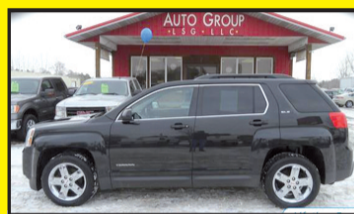
2012 GMC TERRAIN SLE2 AWD $11,995