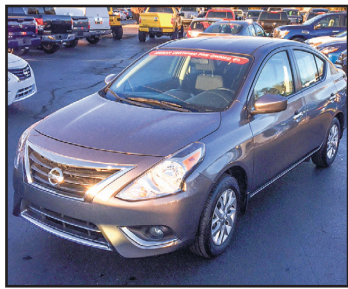
2018 Nissan Versa S

ONLY $12,599 HL902290U Certified Pre-Owned