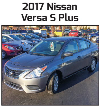
2017 Nissan Versa S Plus

ONLY $12,599 HL902290U Certified Pre-Owned