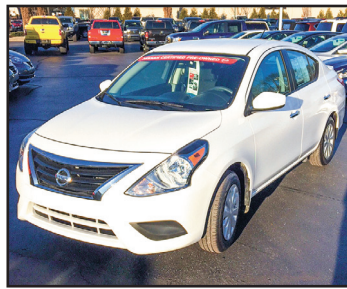
2017 Nissan Versa SV

ONLY $12,999 JL80844OU Certified Pre-Owned