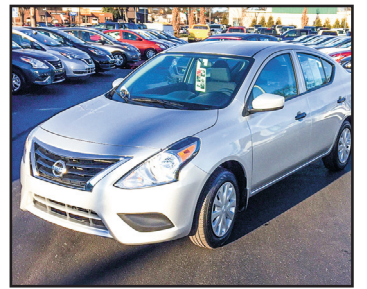
2017 Nissan Versa Note SV

ONLY $12,999 HL894131U Certified Pre-Owned