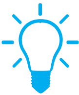
Online Reviews Management