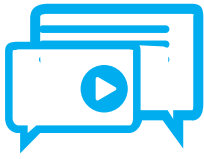
Google Adwords/YouTube Marketing