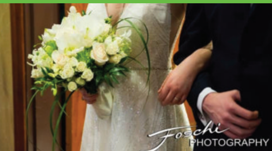
Celebrations Design Group

Flowers and Décor for Weddings & Special Events