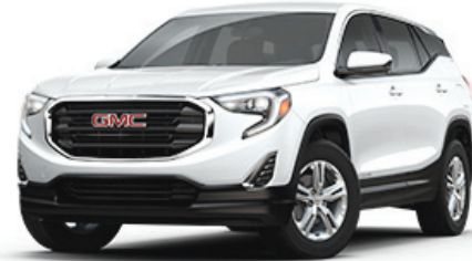
2018 GMC TERRAIN SLE

Ultra low mileage lease for well-qualified non-GM lessees.