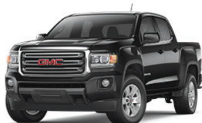
2018 GMC CANYON 2WD CREW CAB SLE

5 0 security deposit. Tax, title, license, extra. Mileage charge of 6 0.25/mile over 32,500 miles.