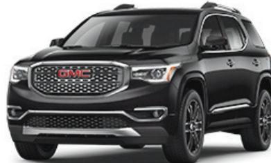
2018 GMC ACADIA

$10,000 Total Value on this Sierra When you finance through GM Financial! 1