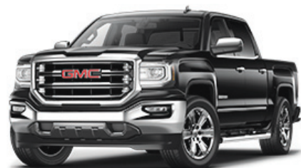
2018 GMC SIERRA 1500 4WD CREW CAB WITH SLT PREMIUM PLUS PACKAGE

Example offer: $3,500 Price Reduction Below MSRP $5,250 Purchase Allowance $1,250 Option Package Discount