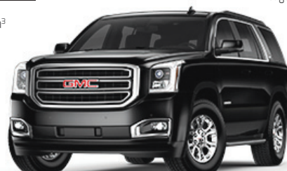
2018 GMC YUKON/XL

6 0 security deposit. Tax, title, license, extra. Mileage charge of 7 0.25/mile over 20,000 miles.