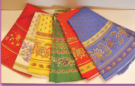
French Provence Tablecloths

QUALITY GIFTS FROM ACROSS THE USA AND AROUND THE WORLD.